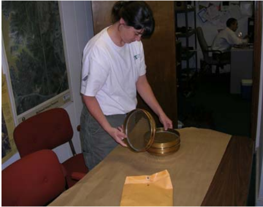
Sorting and cleaning native plant seed.