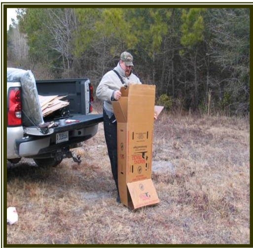
Putting together wild turkey transfer boxes on 16 February 2007. We rocket netted and transferred 9 wild turkeys from MCAS Cherry Point to MCB Camp Lejeune.